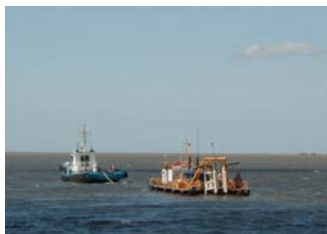
Polka Tug towing the jetting barge into position. Both vessels are controlled by HYDROpro BMS software.

Conclusion. Hydronav provided complete installation and training services for Pt McConnell Dowell Indonesia on site. The jetting operation runs 24 hours per day during construction and the jetting barge and two anchor handling tugs are permanently monitored and controlled from the survey office on the main Sierra Barge using the HYDROpro Construction BMS software. Anchor positions and commands are relayed by automatically from the survey room by UHF data radio to the Tugs. After completion of jetting the hydrographic survey is carried out using the survey boat and as-built position of pipe is recorded using RTK GPS in backpack, operated from the survey boat.