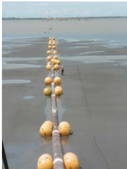
Pipeline at low tide

Background. PT McConnell Dowell Indonesia won the contract to construct a high pressure gas pipeline for TotalFina's Tunu Field Development Phase 8, in Tunu Field, Handil – East Kalimantan.