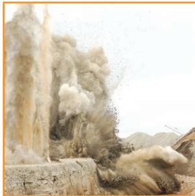
The Boretrak system enables faster yet safer rock face blasting.