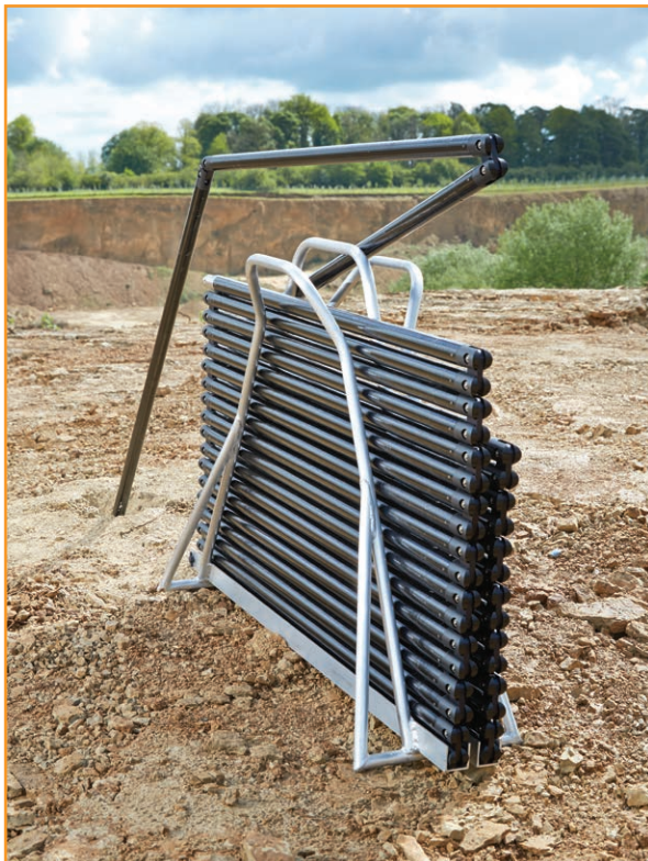
Rodded Boretrak's rods guide and locate the probe.

Rodded Boretrak gives unique capabilities to measure borehole deviation in situations where other systems will not work: in underground mines, areas of ferrous materials and uphole as well as downhole. Its unique method of deployment ensures accuracy where other systems underperform and it offers significant advantages over cabled systems for many applications.