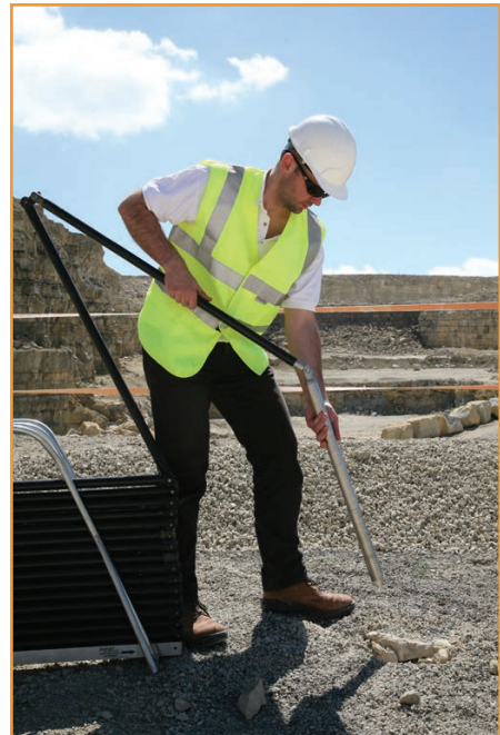
The quick-to-deploy Boretrak is designed for use by a single operator.