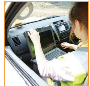
View and analyse borehole data results on your PC within minutes and make faster decisions.