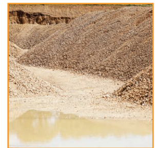
Optimised blasting means you can plan to produce finer rock particulate for easy removal.