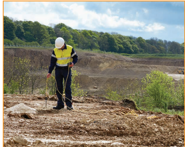
The benefit of a Cabled Boretrak is speed and portability.

Other probes used to measure borehole deviation, including our Cabled Boretrak, rely on compasses to help measure borehole angle heading