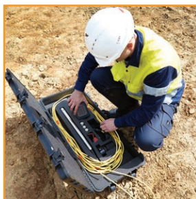
Renishaw's Cabled Boretrak system is supplied in a Peli-case that can be hand carried by a single operative.